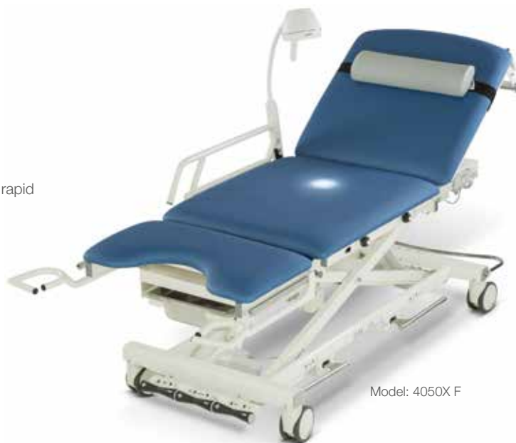
Model: 4050X F