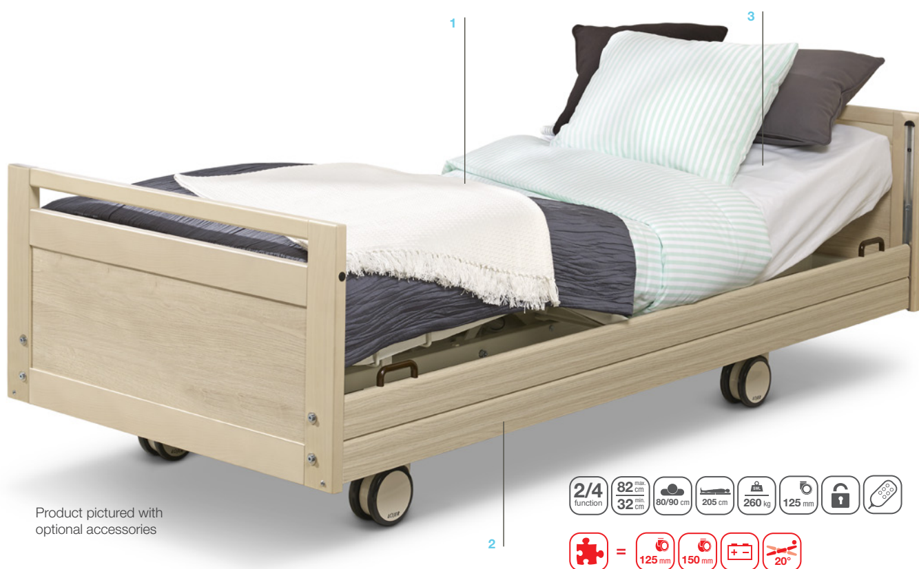
Product pictured with optional accessories