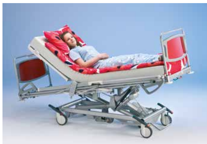
The Trendelenburg position is often used to support postural care. The vertical raising motion does not require additional space, which means the position can be changed, even in tight surroundings. The unique lifting mechanism has been patented.