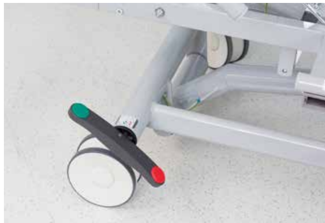
The design of the brake pedal facilitates the locking and releasing of the brake. The dual castors make the bed easy to manoeuvre.