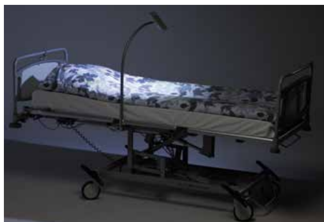
The optional patient panel can be used as a handy reading light. Bed in picture is Futura Plus, the control panel and light is the same as in Carena (not designed for washing)