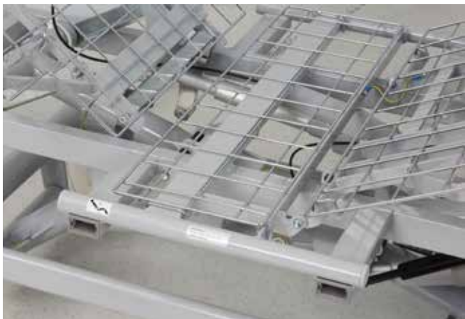
The mattress base of the washable Carena is made of metal net.