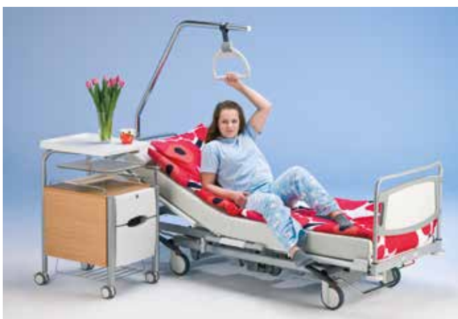
Correct and variable treatment positions are crucial for patient comfort, and they are easy to carry out with the four-part bed section. Climbing in and out of bed has been made easy for the patients.