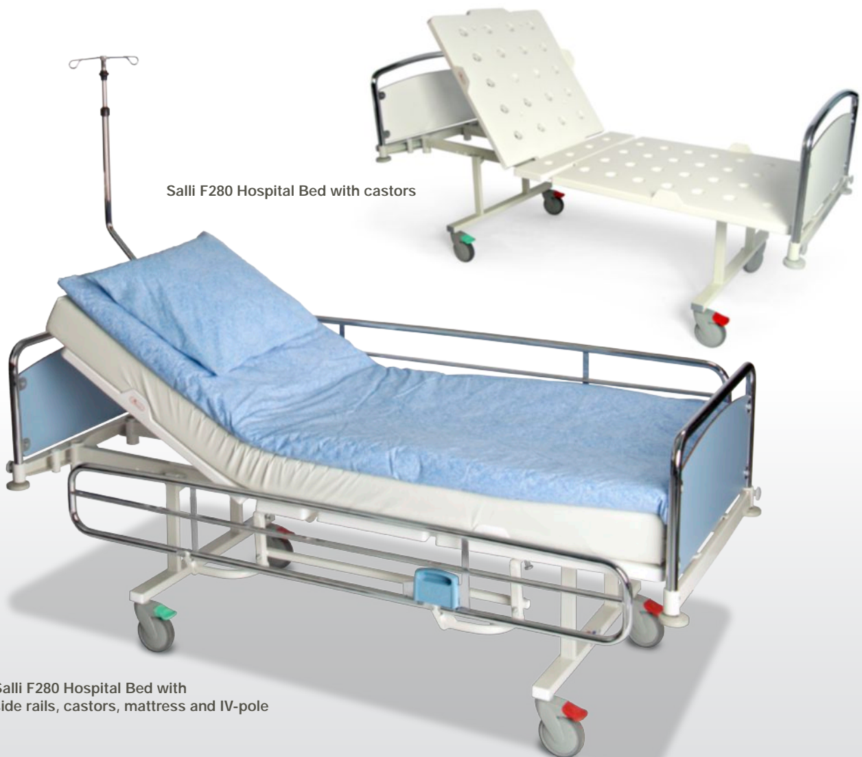
Salli F280 Hospital Bed with castors

"Easy to use, modular and functional bed collection."