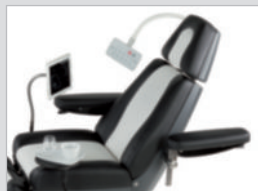
Tablet support with flexible arm