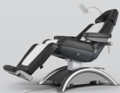
Capre MC Medical Chair

"Highest quality solution for recovery after day surgery, dialysis and cytostatic treatment, and general examinations."