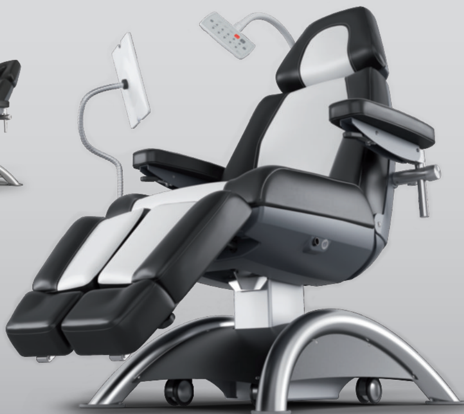
Capre RC Recovery Chair