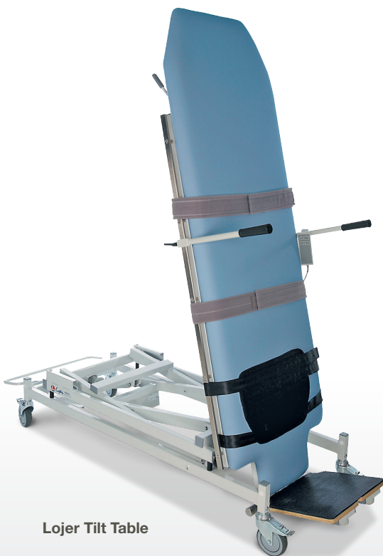
Lojer Tilt Table

"Quality construction and carefully selected components ensure patient safety."