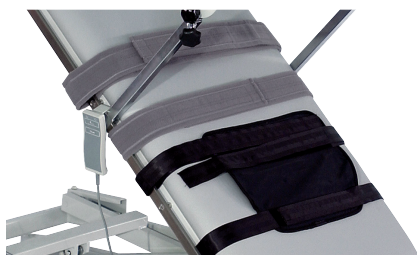
Set of attachment belts