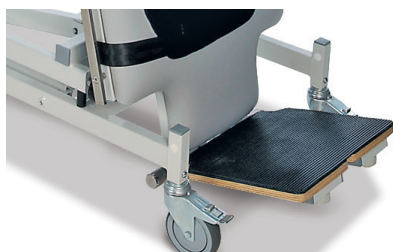
Foot plate, one part