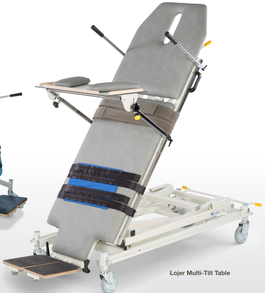
Lojer Multi-Tilt Table