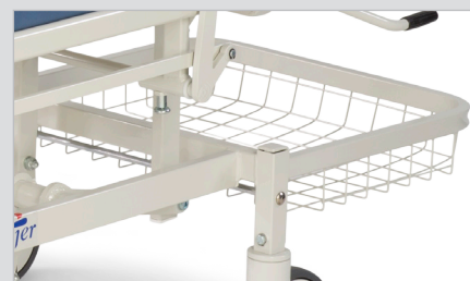
Accessory basket for the lower frame