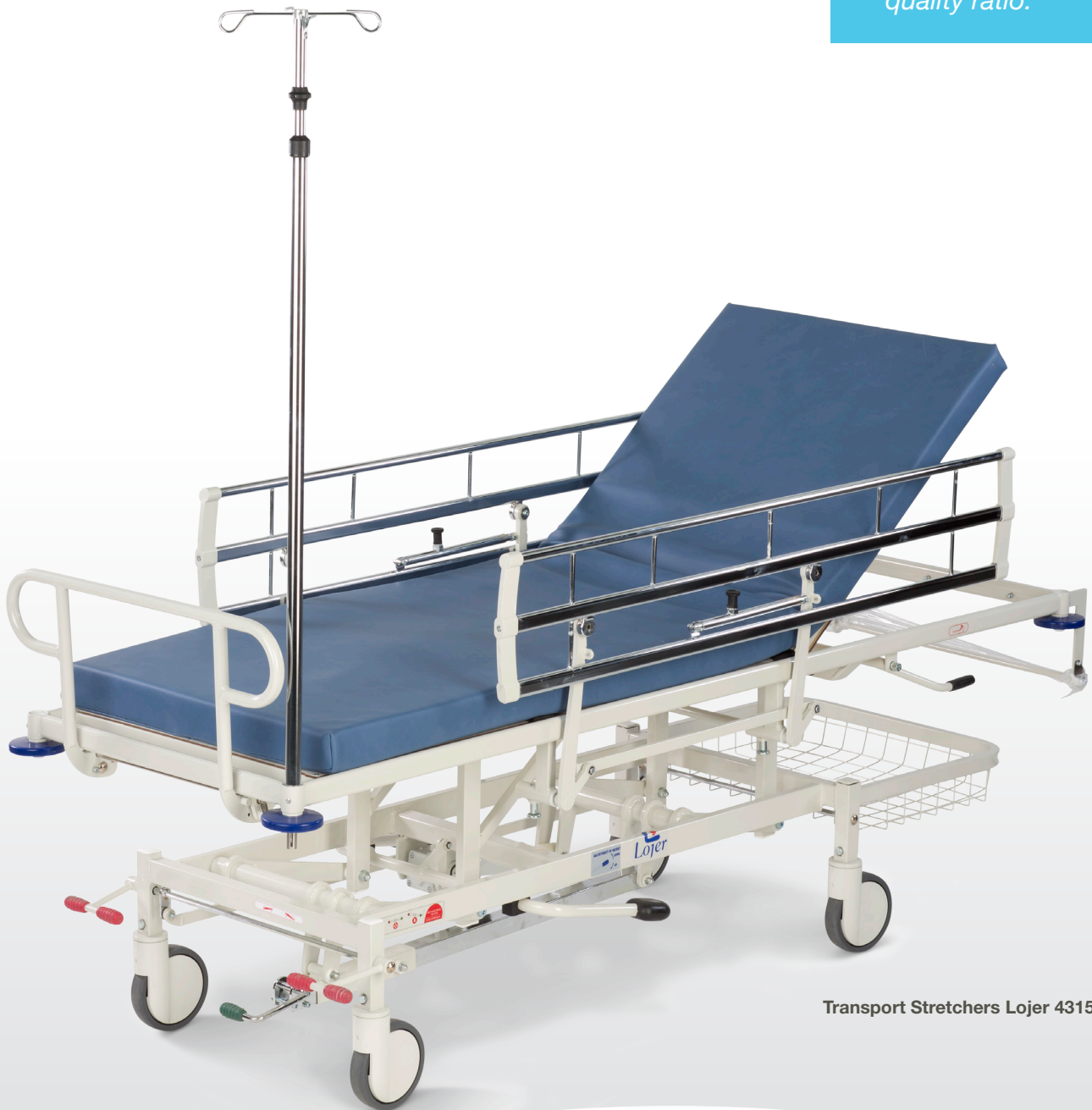
Transport Stretchers Lojer 4315

"Easy and agile to steer, light construction, excellent price/quality ratio."