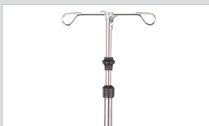
IV stand, straight model