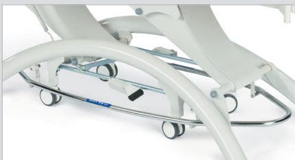
360° height adjustment foot bar