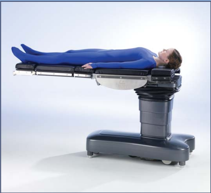
ENT and Ophthalmic surgery