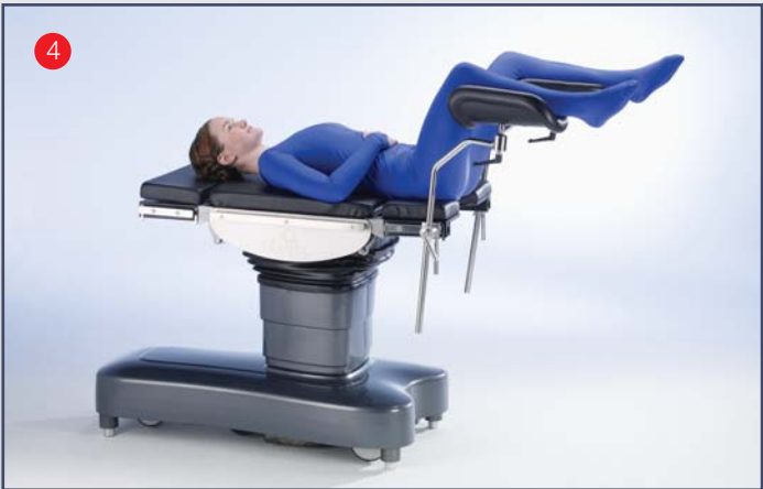
4 Lithotomy position with traditional leg supports 5 Knee arthroscopy 6 MIS interventions such as cholecystectomy 7 Cystoscopy/Endourology with 40 cm extension - Foot control with three movements - Urocatcher available - Fluoroscopy area (450 x 400 mm) with extension section