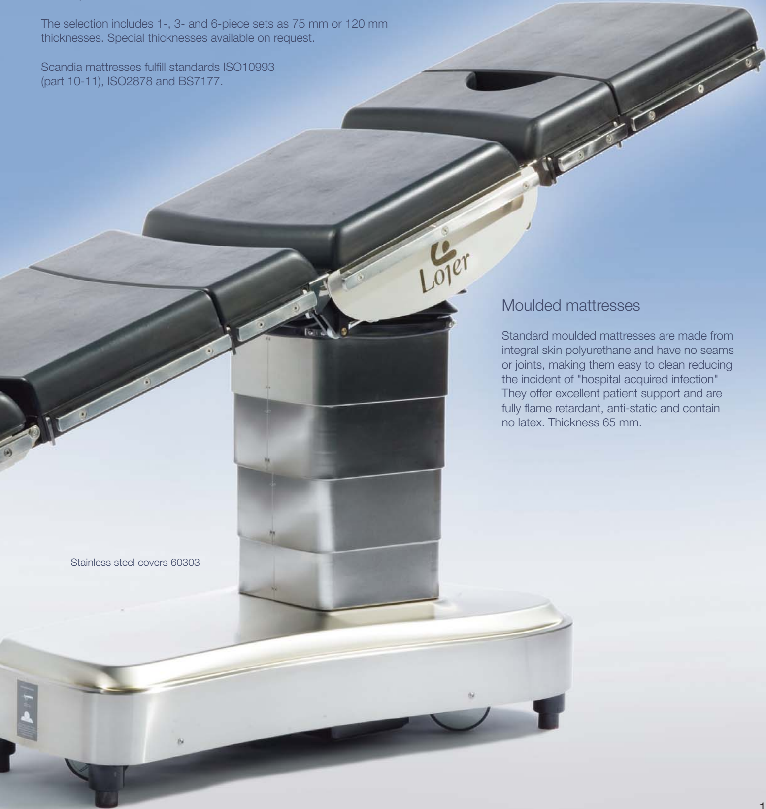
Stainless steel covers 60303

Scandia mattresses fulfill standards ISO10993 (part 10-11), ISO2878 and BS7177.